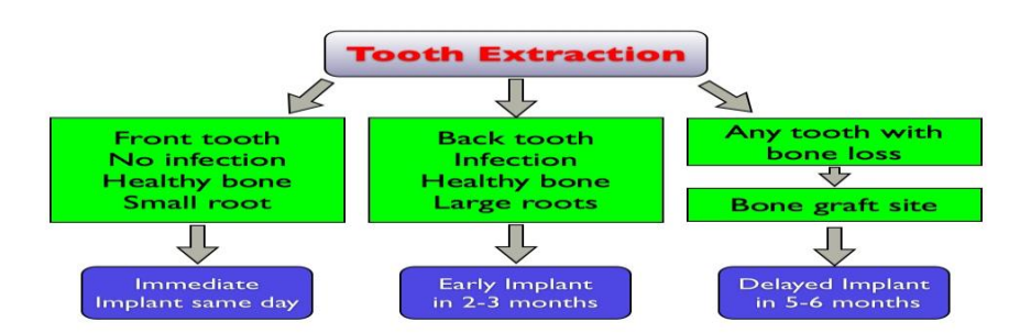
Fig.1; Delayed implant placement

Based on the time elapsed between extraction and implantation, the following classification has been established relating the receptor zone to the required therapeutic approach: