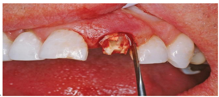
Fig. 3. #21 atraumatically extracted using a Periotome

A 65-year-old male, who is a long time patient in the our dental clinic presented with tooth #21 having suffered a vertical fracture below the gingival level on the lingual aspect. The coronal tooth fragment was retained by the gingival attachment. It was endodontically treated seven years earlier, and the patient elected not to crown the tooth as advised. A 1 mm diastema is present between the central incisors. Numerous wear facets and abfractions are noted, and the patient was advised on multiple occasions regarding the need for restorative and reconstructive dentistry. He has mild-moderate generalized periodontal disease, with no pockets greater than 4 to 5 mm. A periapical film was taken, and evaluated regarding possible implant placement. As the patient has frequent dealings with the public, he didn't want to be without a front tooth at any point in the procedure.