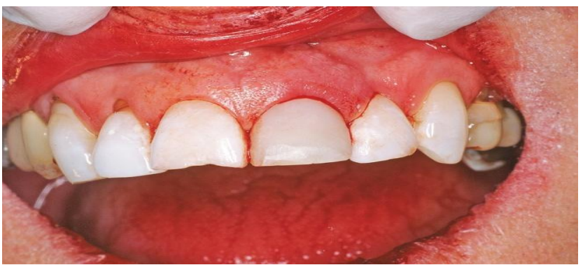
Fig.9; Temporary crown immediate post-op.

This technique is the same whether the provisional is made at the time of implant surgery, or during second stage uncovering of the implant. After the second stage implant recovery, or when the temporary crown and abutment is fabricated. if at the same appointment as the implant placement , the emergence contour is customized to the desired profile with either light cured composite resin or acrylic materials, and an appropriate healing time is allowed for osseointegration and soft tissue development. The healing abutment should recreate the subgingival contour of the tooth, and apply the correct pressure to the facial and interproximal tissues to support their contour and shape, and help prevent collapse. In the clinical case described, at the appointment for recording the impression, the customized healing abutment was removed from the mouth and attached to a laboratory analogue. This assembly was then embedded in silicone putty to about the level of the mid-facial. The buccal surface was marked to assist in the orientation of the post for future steps. Keeping the analogue in place within the putty, the customized healing abutment was