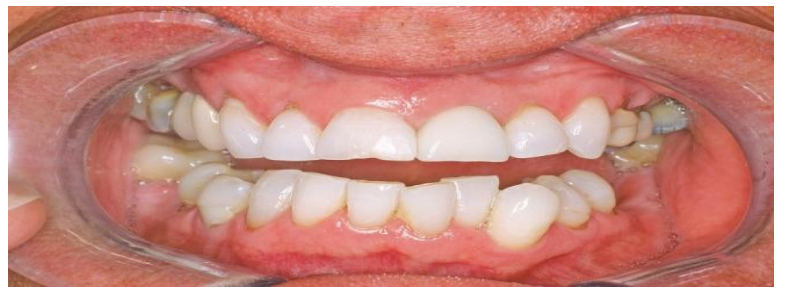
Fig.15; #21 three month post-op

The technique described in this report is characterised by the immediate loading of a conical implant in a postextraction site, with no flap elevation, filling the socket not with heterologous bone but with a fibrin sponge, the use of a mount as transfer and abutment, and finalisation with a metal-ceramic crown.