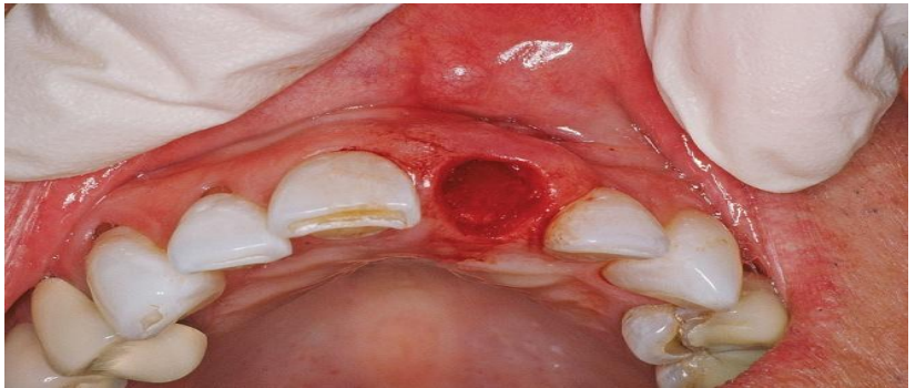
Fig.4; . #21 extraction socket. Buccal plate intact.

The patient was presented with a number of treatment options. The choices included extraction of the fractured tooth followed by replacement with a bridge utilizing #11 to #22 as abutments, a removable partial denture or extraction of the fractured tooth and replacement with an immediate implant placement and PFM. The patient refused any removable options and requested an implant in the #21 site. It was explained to the patient that only following extraction of the tooth, could the alveolus be evaluated for possible immediate implant placement, and that if the alveolar conditions were not favorable i.e. due to buccal plate fracture during the extraction, or the presence of a fenestration, that the socket would be grafted and the implant placement delayed. Consent and medical forms were completed, and any patient questions answered.