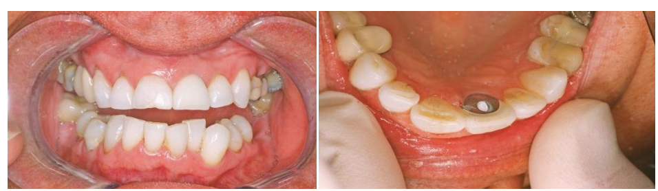
Fig.14; Screw access opening is plugged with Teflon plumbers tape prior to sealing the access with composite resin.

The anterior region of the maxilla is frequently termed the aesthetic zone due to its high visibility and influence on facial appearance. Single tooth implant replacement in this region can present many clinical challenges.[13,14,15,16] Not only must the crown conform in contour, shade, and texture to its neighbors, but the gingiva must also be in symmetry and harmony with the adjacent tissues.[15,16,17,18,19,20]